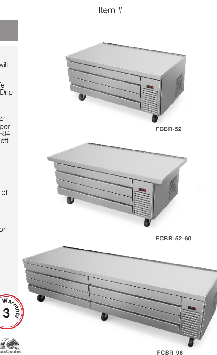
*Conforms to UL & NSF-7 standards