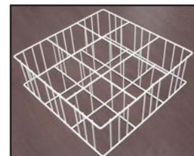
9 Compartment Rack