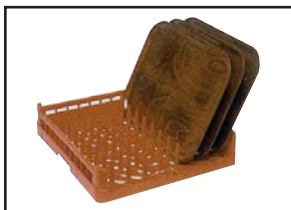
Tray Rack, 20"x 20"