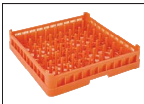
All Purpose Rack, 20" x 20"