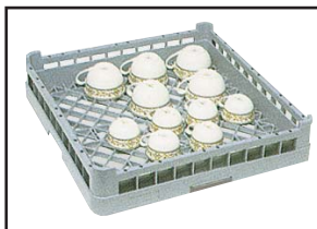
Peg Rack, 20" x 20"