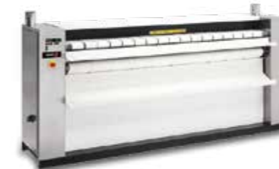
Wall flatwork ironers roll 35

The range of flatwork ironers with rolls from 8" (200mm), 14" (325mm) and 20" (500mm) is perfect for those small and medium sized laundries which need an optimum ironing quality with minimum operation and maintenance costs.