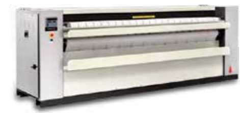
Wall flatwork ironers roll 50

The ironing output (between 22lb/hr (10 kg/hr) and 265 lb/hr (120 kg/h), depending on model) and the heating types (electric, gas, steam) makes them flexible to adapt to the different needs of the customers.