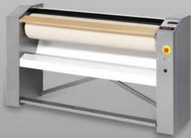
Wall roller ironers