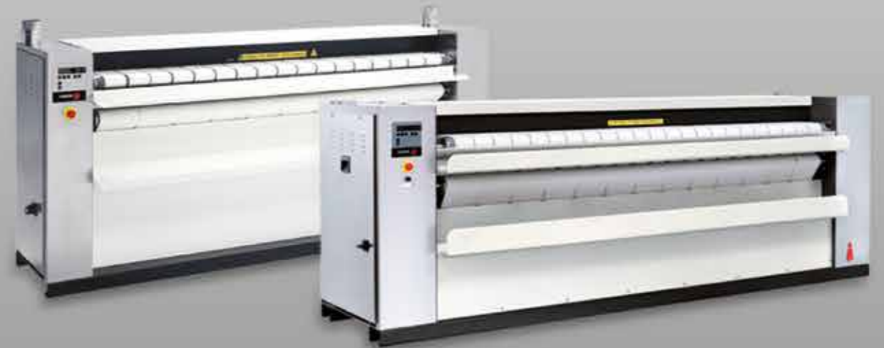
Wall flatwork ironers roll 35